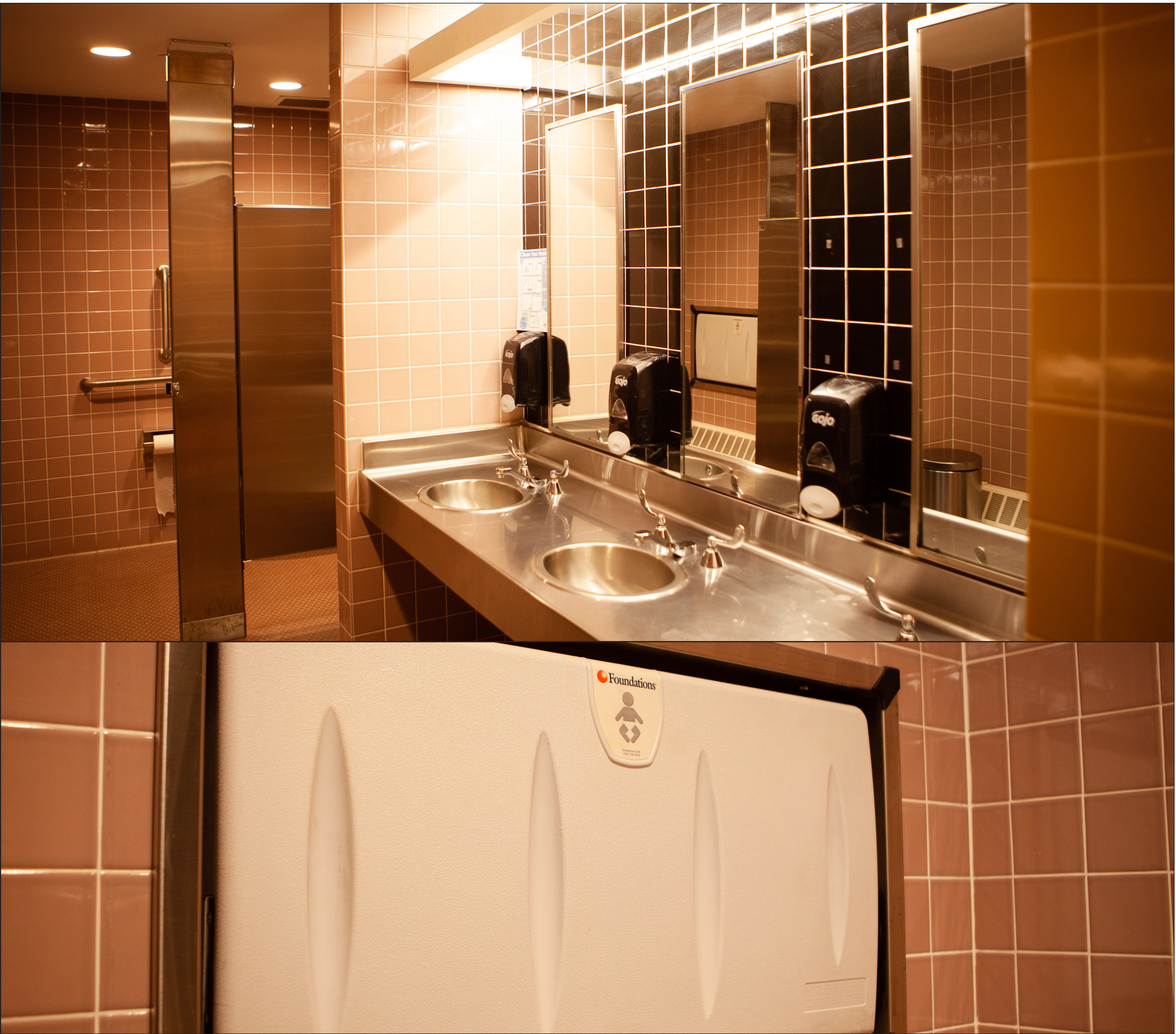
There are changing stations in both of the bathrooms. Bathrooms are equipped with automatic paper towel dispensers and sharps disposal containers .