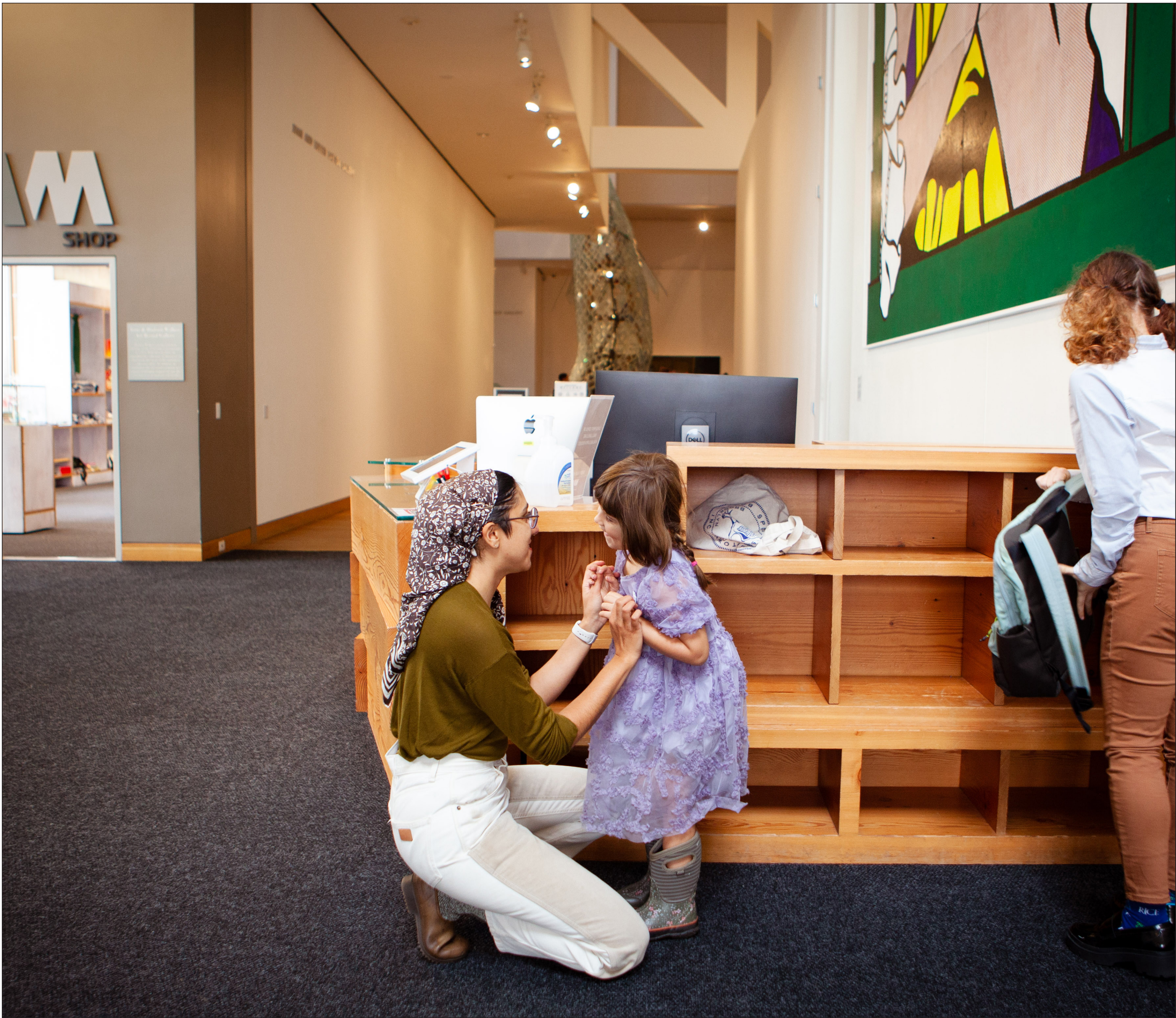
If I want, I can leave my things in cubbies that are attached to the front desk.