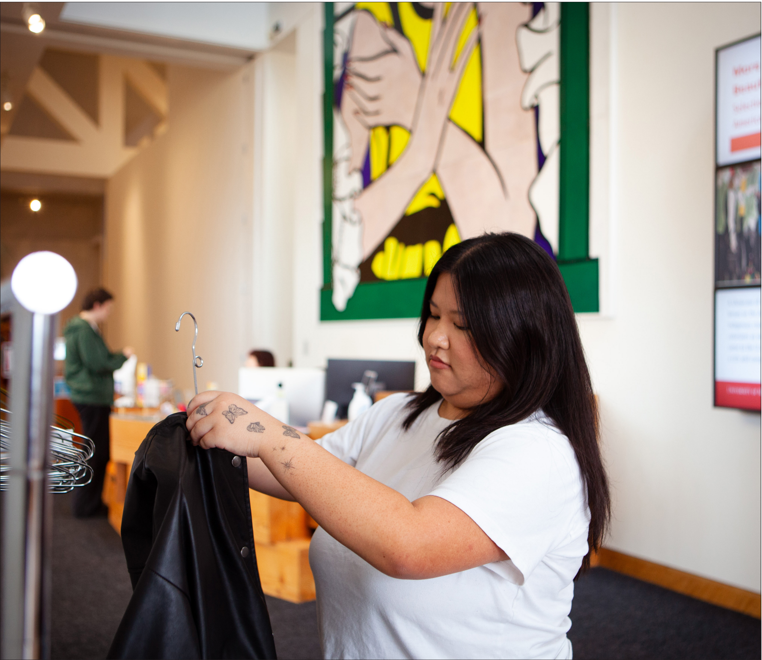
I can also leave my coat on a metal coat rack , nearby. I will need to remember to come back to get my things when I leave.