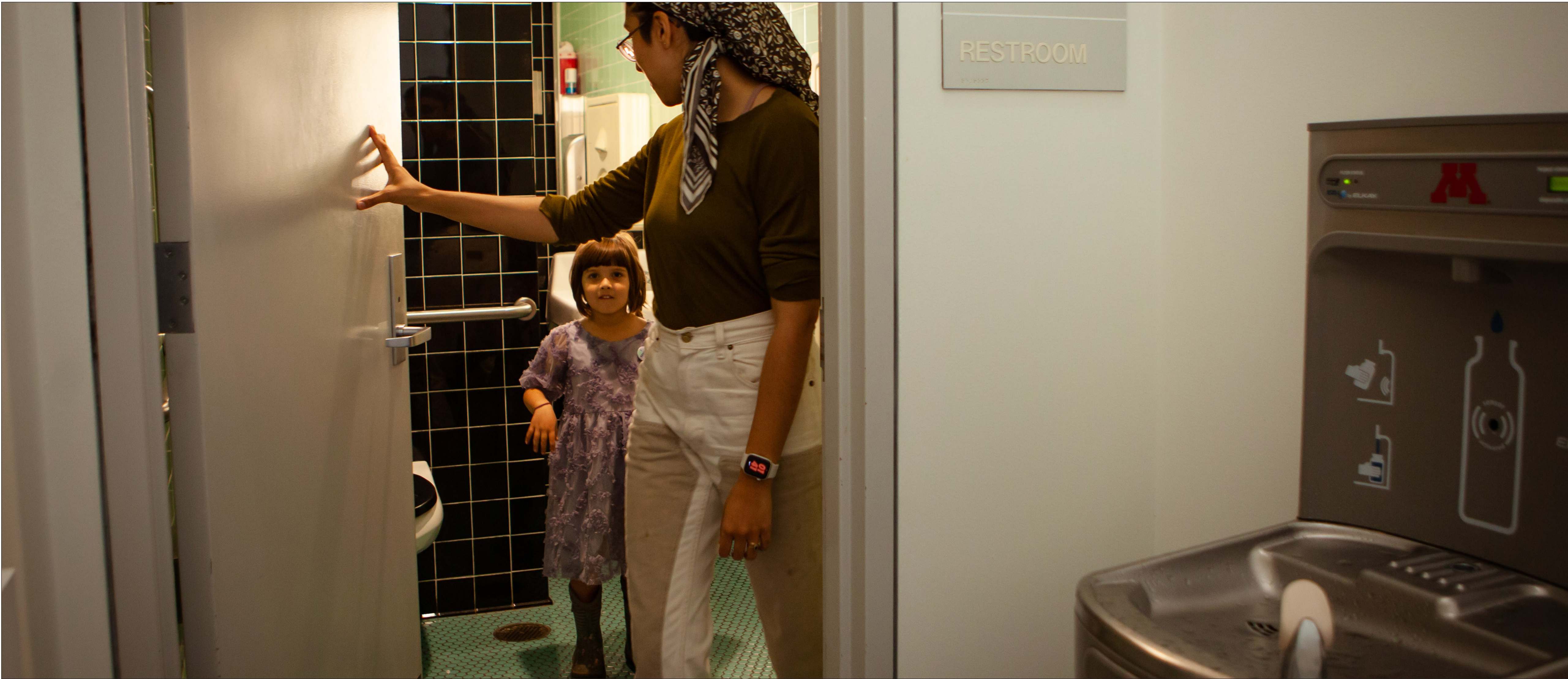
There is a gender neutral bathroom with a water fountain behind the front desk .