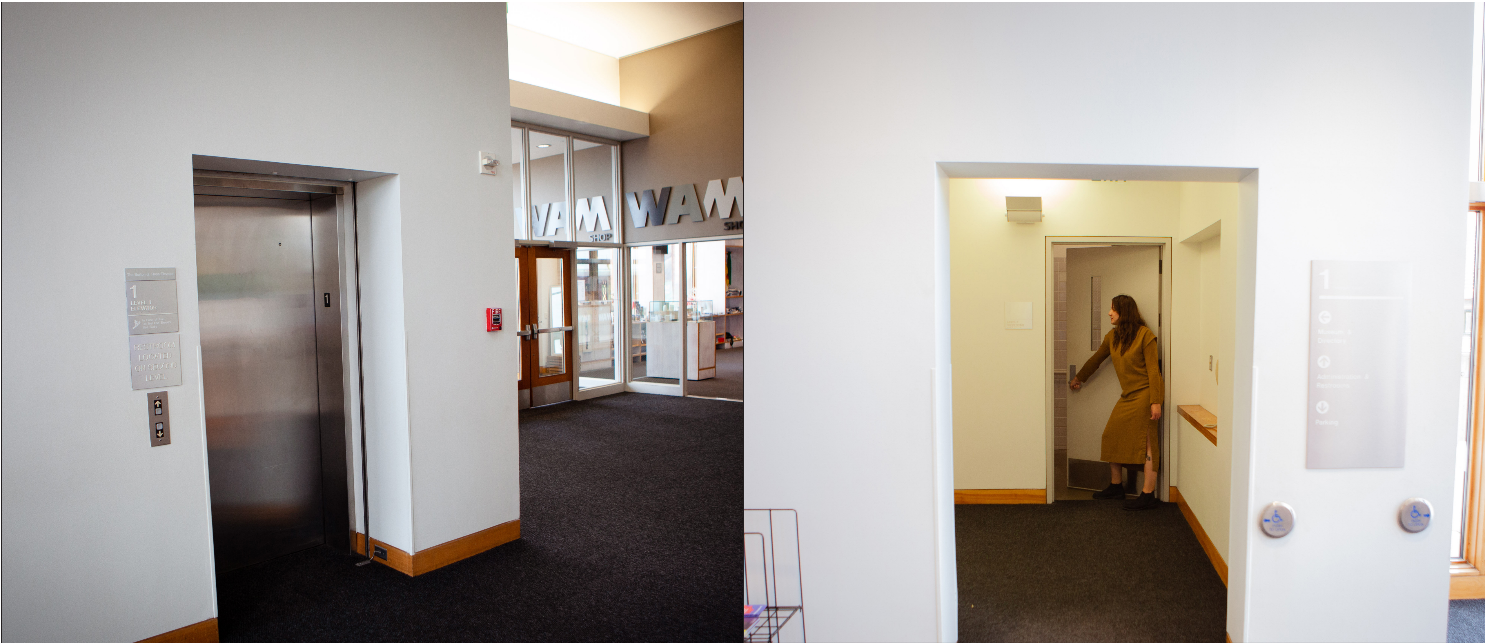
To get to the second floor of the museum, I have two options. I can take the elevator or the stairs .