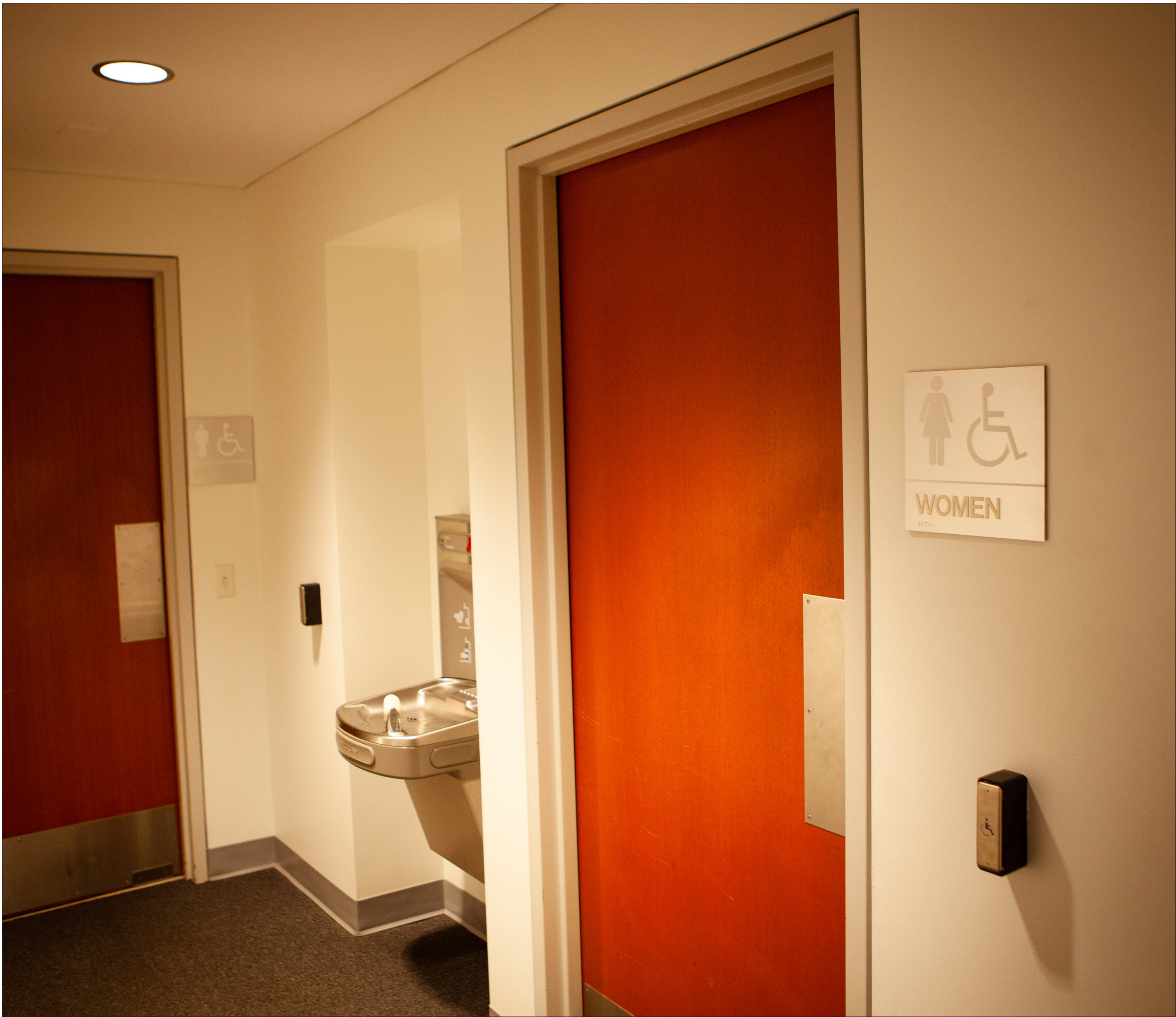
The second floor bathrooms are gendered, and I will see a water fountain in front of them.