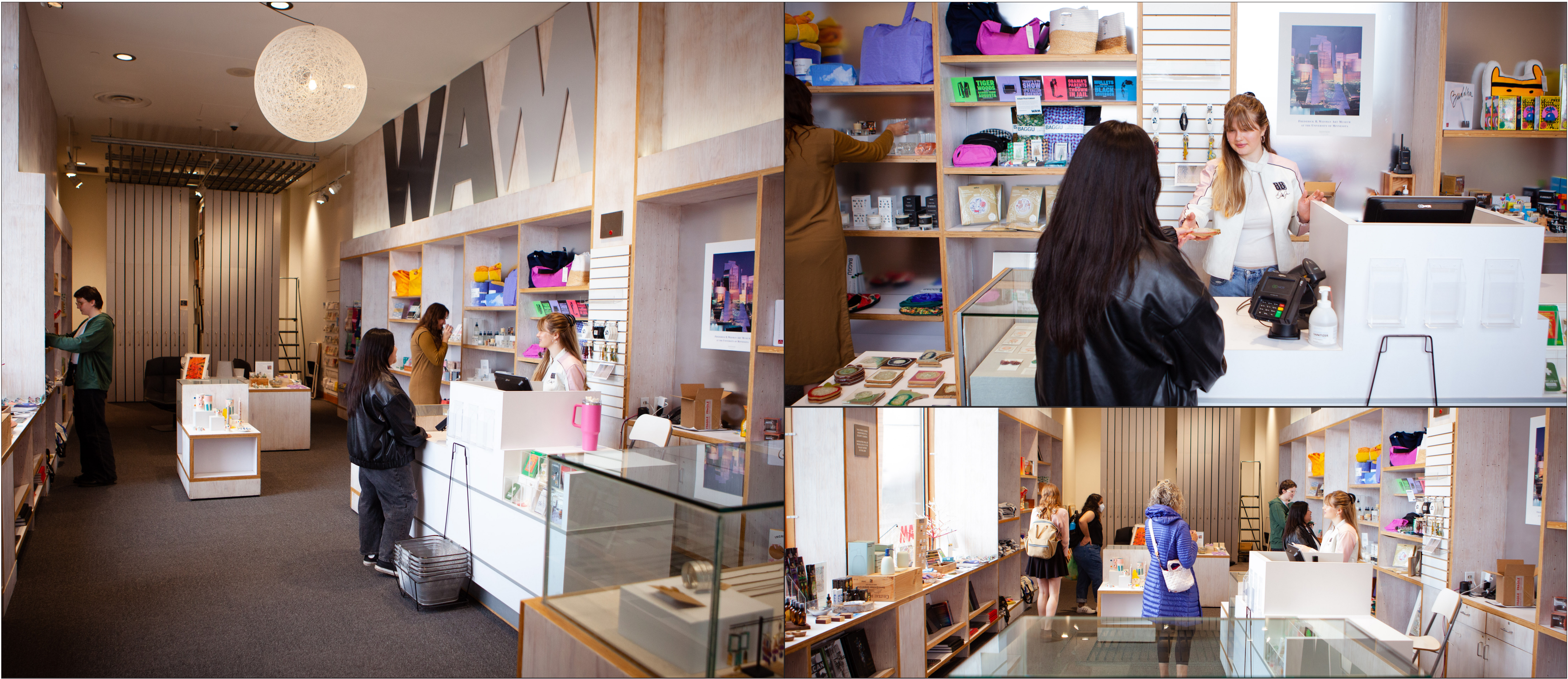
This is the gift shop at the Weisman Art Museum.