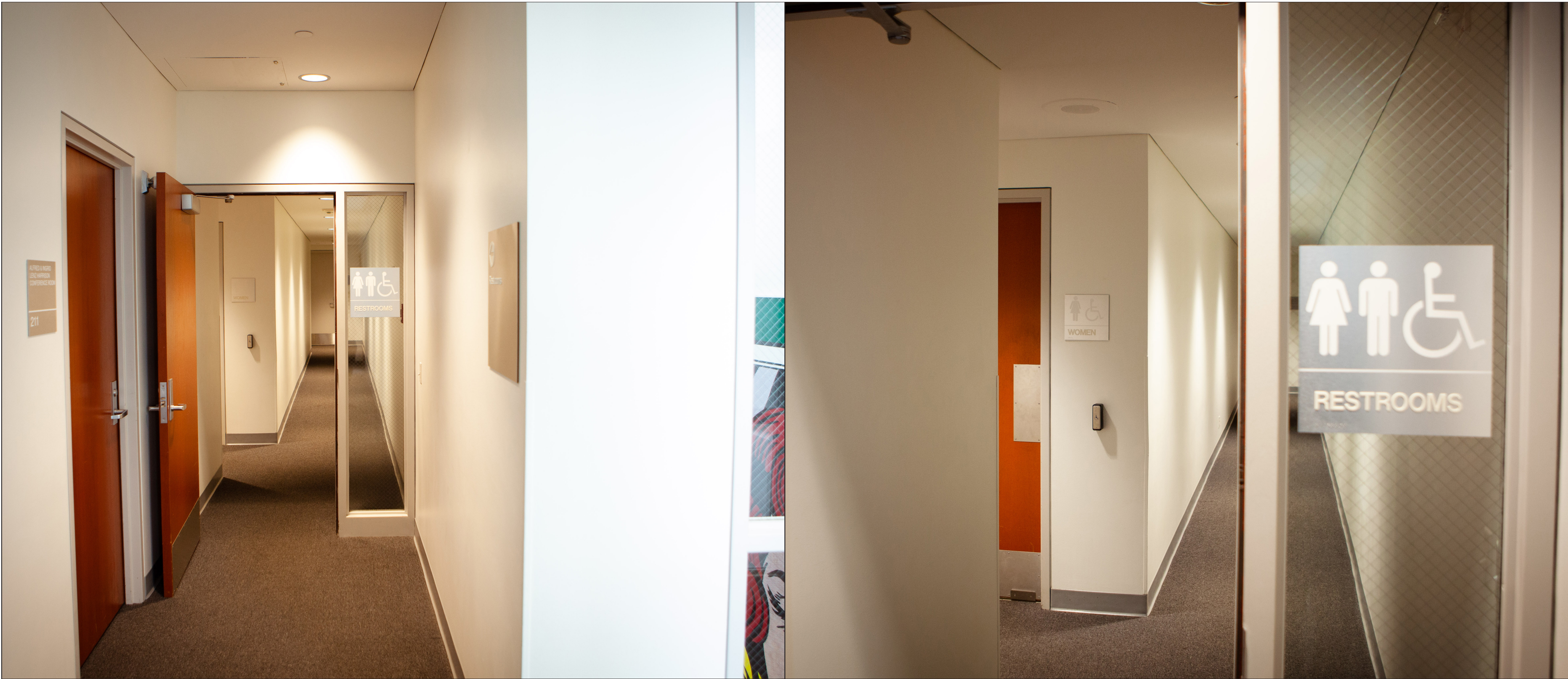
When I exit the elevator or the stairs on the second floor, bathrooms are to the left down a hallway.