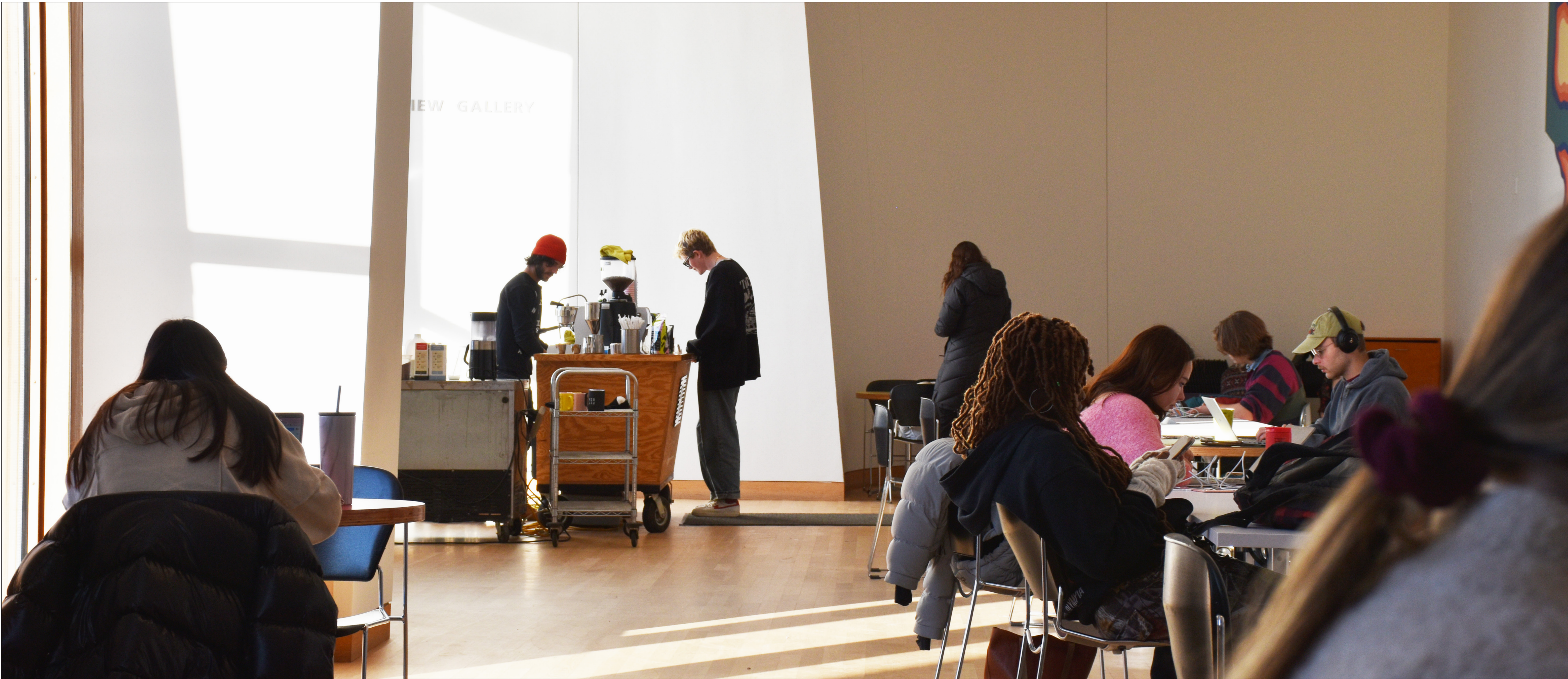
On Wednesdays, there will be a coffee cart here when I visit the museum. There will be a line of people waiting to buy coffee during these times.