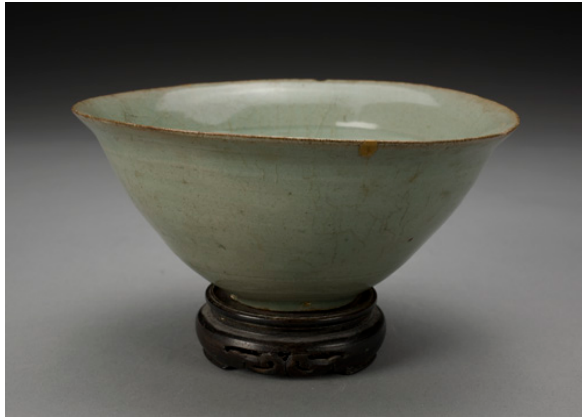
Artist unknown, no title, bowl, 11 th -13 th c., porcelain. Selection Criteria: Oldest object accessioned by year.

Minnesota State Fair, University of Minnesota student's choice, longest accession number, curator's choice, museum visitors, artists registered on mnartists.org , and visitors to the museum.