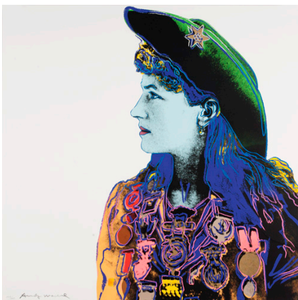
Andy Warhol, Annie Oakley, 1986, screenprint on paper. Selection Criteria: Tour guides.

MINNEAPOLIS – In a series of three exhibitions for the 2013-14 season, the Weisman Art Museum at the University of Minnesota will highlight 20 works x 20 years from its collection. The resulting 400 works, all collected since opening the current Gehry-designed building in 1993, will be featured in a variety of modes including three gallery exhibitions and virtual presentations through WAM's website. The modes of exhibition selection will push the boundaries of the traditional curatorial process and emphasize participation from the traditional single curator to collective decision-making, from fact-based analysis to