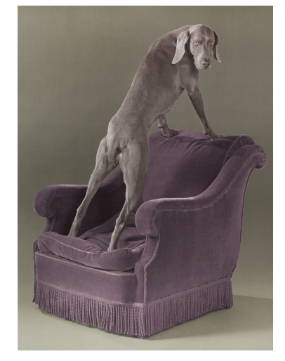
Selection Criterion: Minnesota State Fair Votes William Wegman, Backview , 1993, photolithograph on paper.

Visitors will have the first view of the summer exhibition WAM@20: MN celebrating twenty years in the Gehry-designed building.